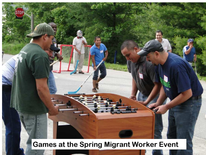
Games at the Spring Migrant Worker Event

Lastly, the extraordinary teamwork, commitment and dedication of those involved, with providing a wonderful, sit-down, home-cooked meal is truly a blessing beyond words!